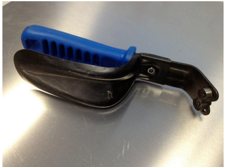
A sheet metal edge deburring tool.