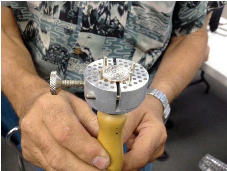
A very handy pin vice to hold small odd shaped parts to work on them.

At the last meeting, several members presented tools that were a bit out of the ordinary that they found to very helpful in building or maintaining their airplane projects. Some photos of a few of these tools are shown here.