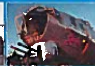
B-17G Flying Fortress "Sentimental Journey"