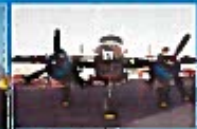
B-25 Bomber "Maid in the Shade"